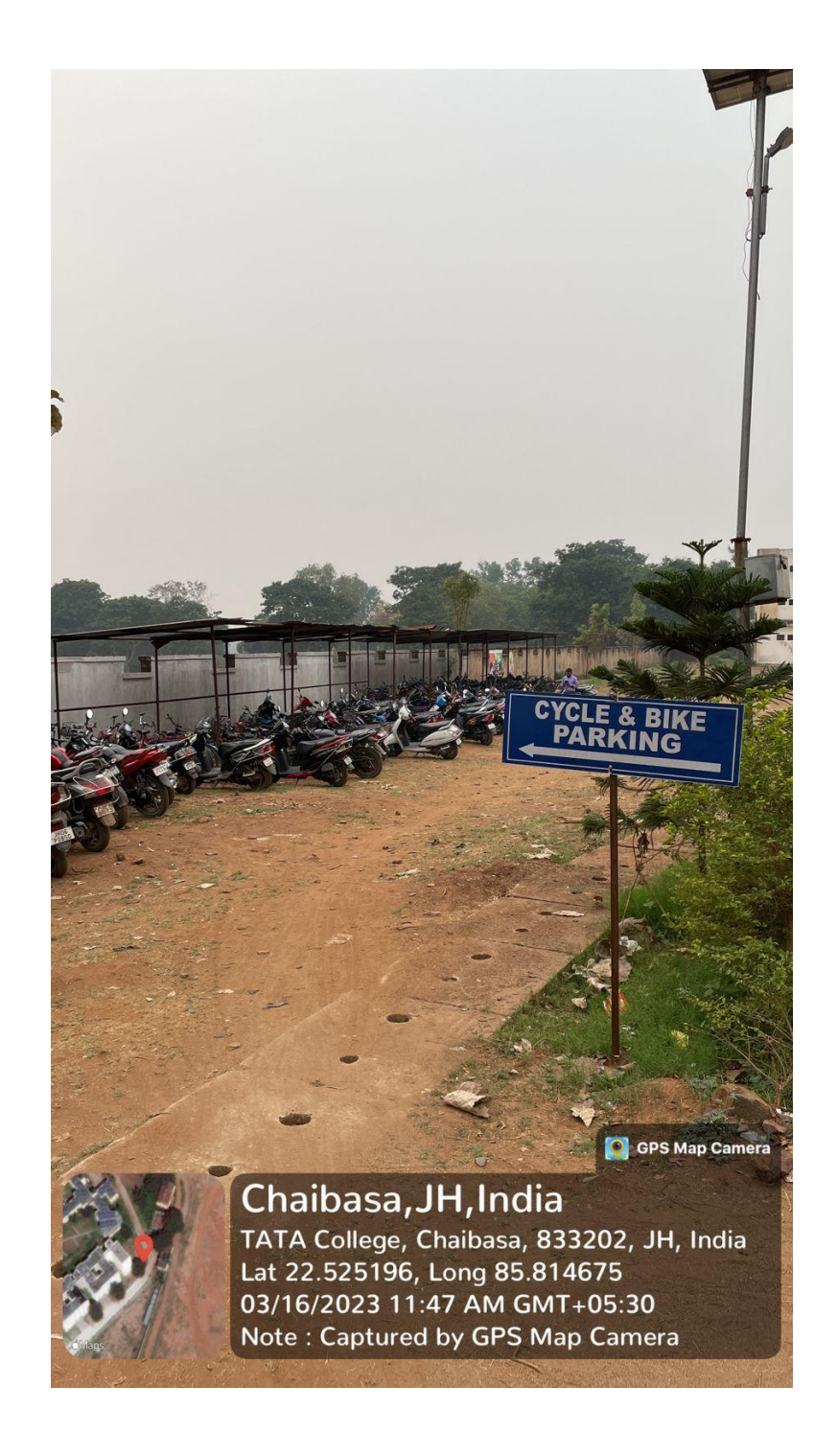
Figure: Bicycle stand in the university campus